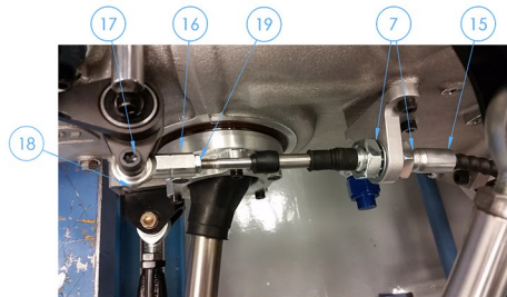
IMAGE OF SHIFT CABLE ON RIGHT SIDE OF GEARBOX